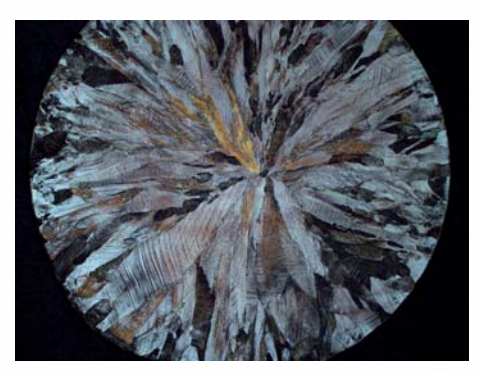
Copper-zinc rod, PLAN FLUOTAR 2.5x, Pol