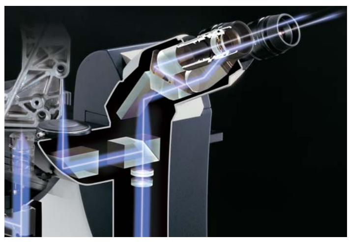
Manual Camera Output

To fit a particular research task, the microscope has to be oneof-a-kind. Leica Microsystems offers a wide variety of configuration options and works closely with accessory manufacturers to ensure that every accessory reliably integrates with the Leica DMI3000 M.