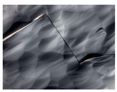
Solar cell, PLAN FLUOTAR 50x, oblique illumination