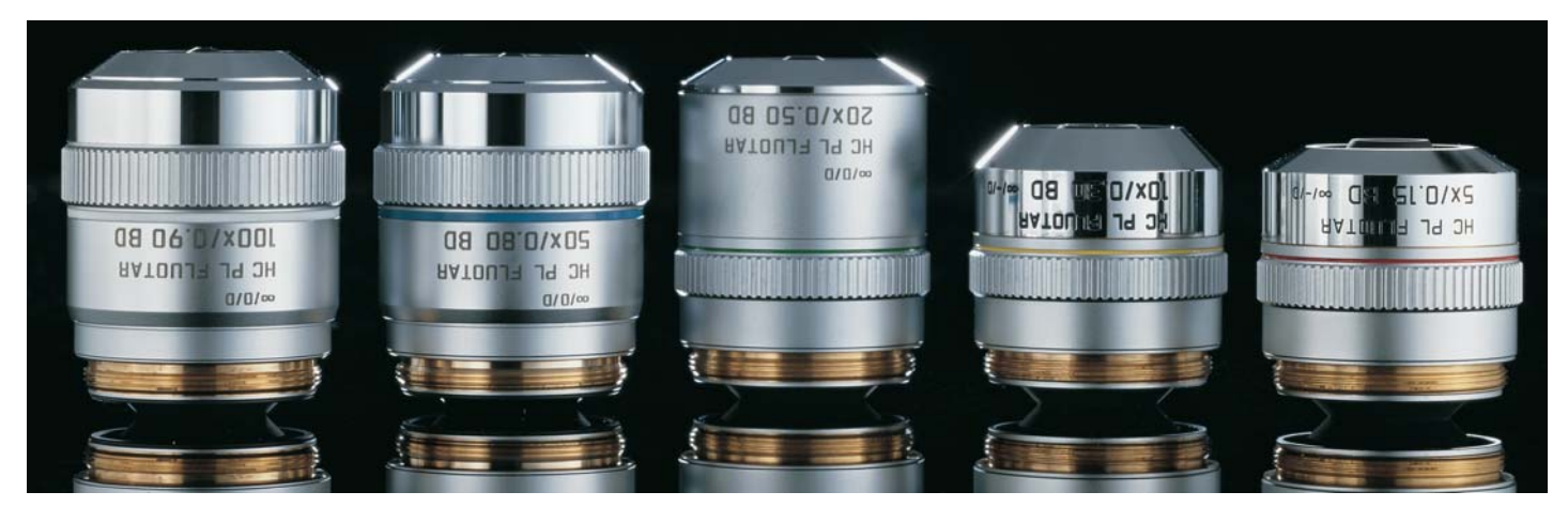
Comprehensive line of objectives – from the HI PLAN (Plan Achromat) to the PLAN APO

The stage drive and focus knob are located very close to each other, which allows the stage and focus to be conveniently adjusted with one hand. Moreover, the flat design of the right focus knob prevents contact with the stage drive.